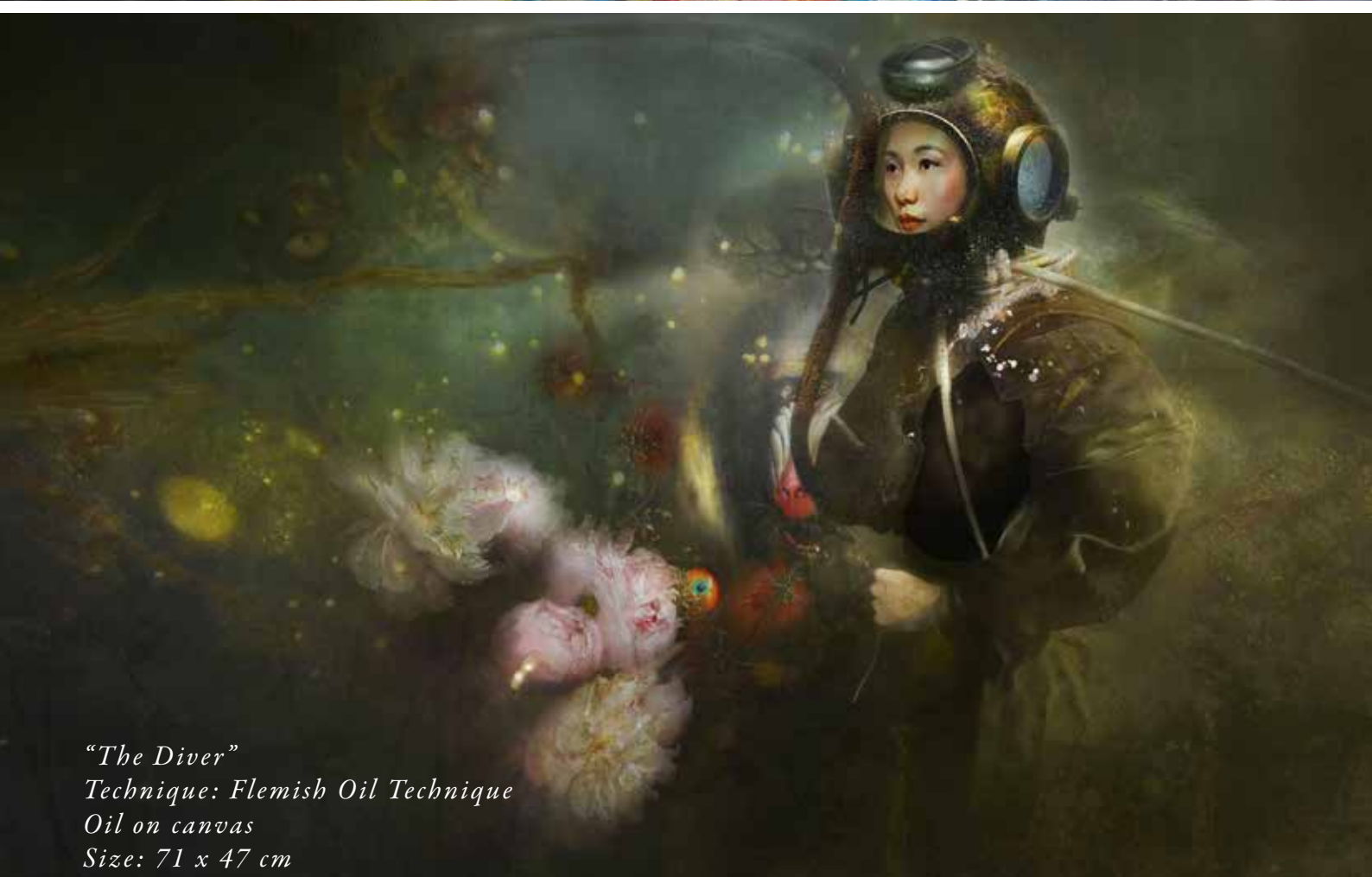
"The Diver" Technique: Flemish Oil Technique Oil on canvas Size: 71 x 47 cm