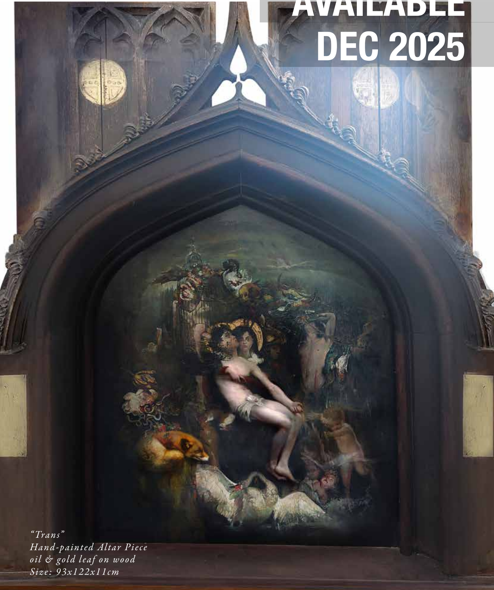
"Trans" Hand-painted Altar Piece oil & gold leaf on wood Size: 93x122x11cm