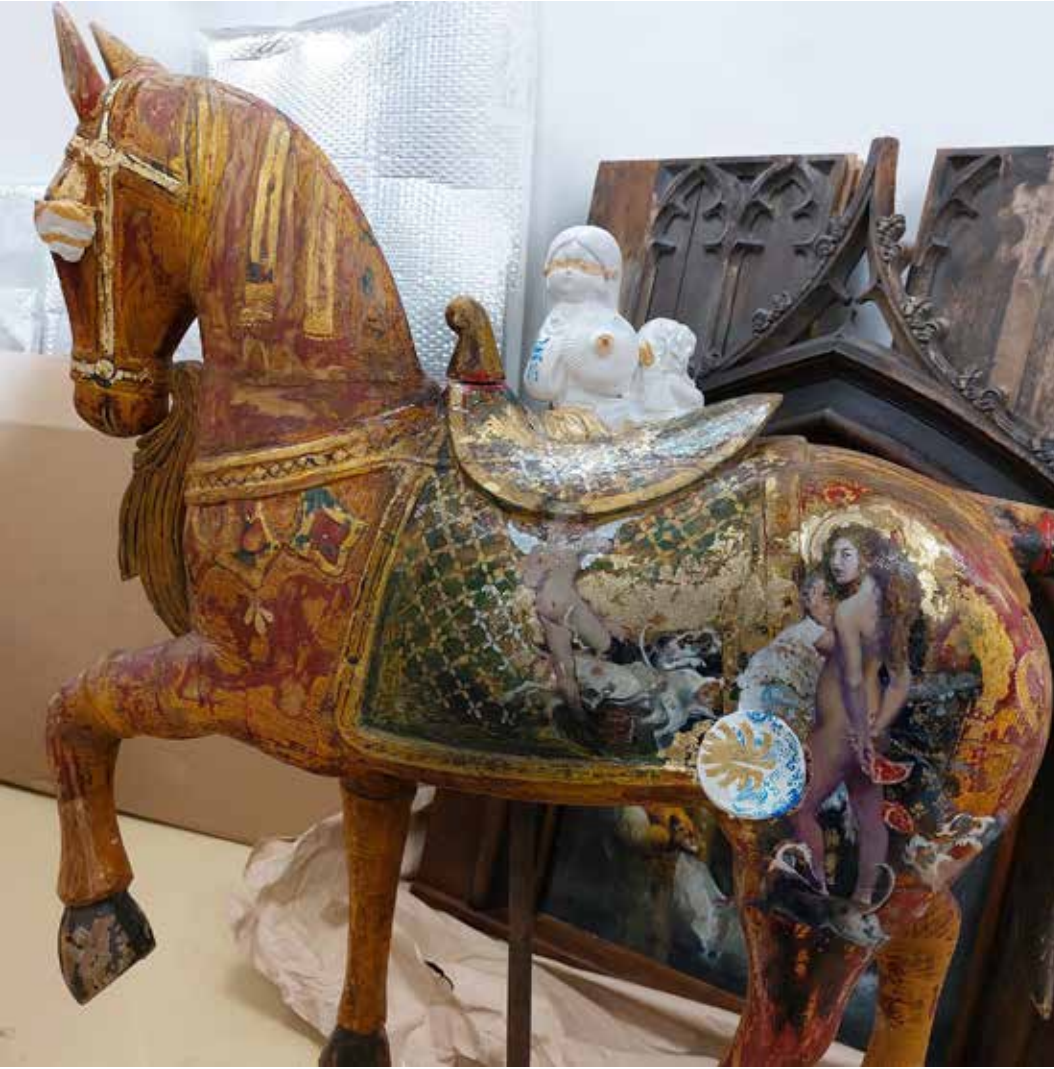
THE FIERCE PAINTING AND SCULPTED ELEMENTS ON HAND MADE WOODEN ANTIQUE HORSE OIL, GLAZE & GOLD LEAF ON WOOD // SIZE: 105X84CM