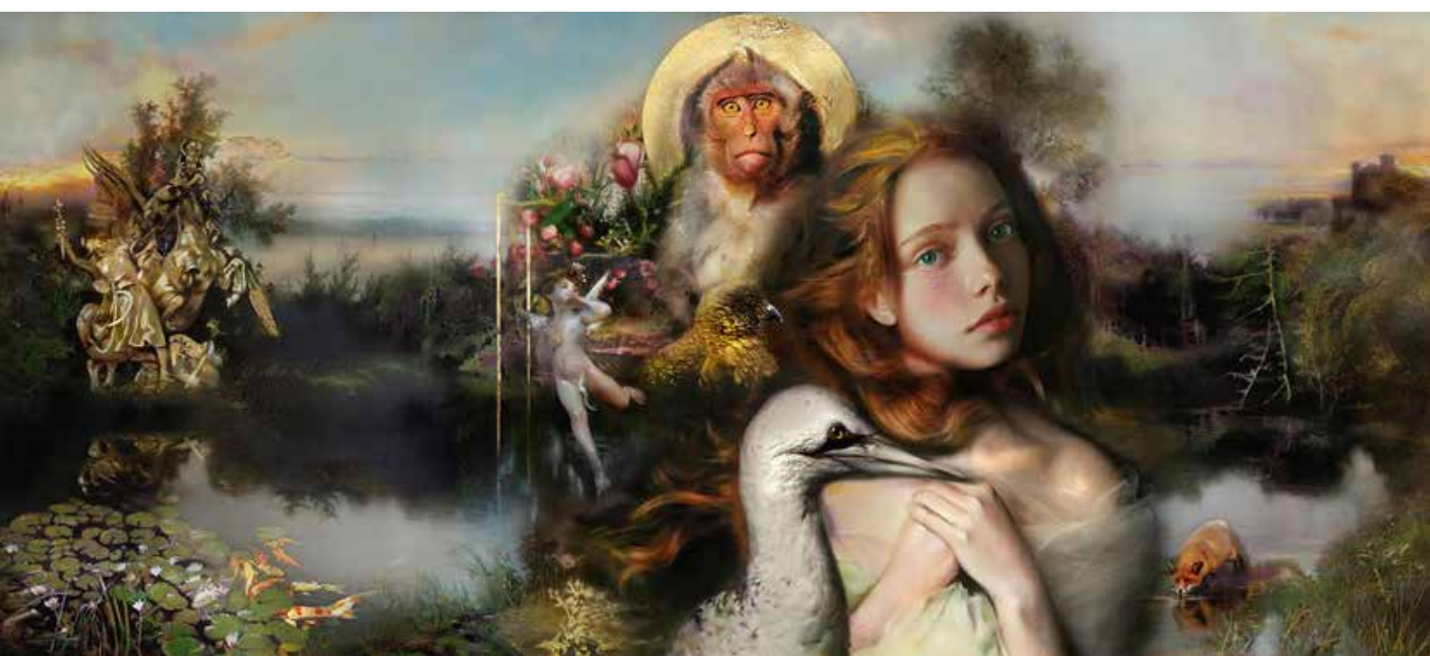
Above: "Peace By Peace" Oil & Gold Leaf on Canvas Size: 107x80cm