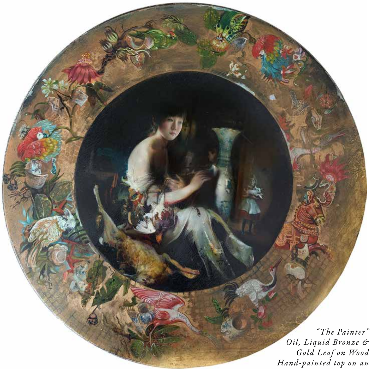
"The Painter" Oil, Liquid Bronze & Gold Leaf on Wood Hand-painted top on a wooden Antique Table