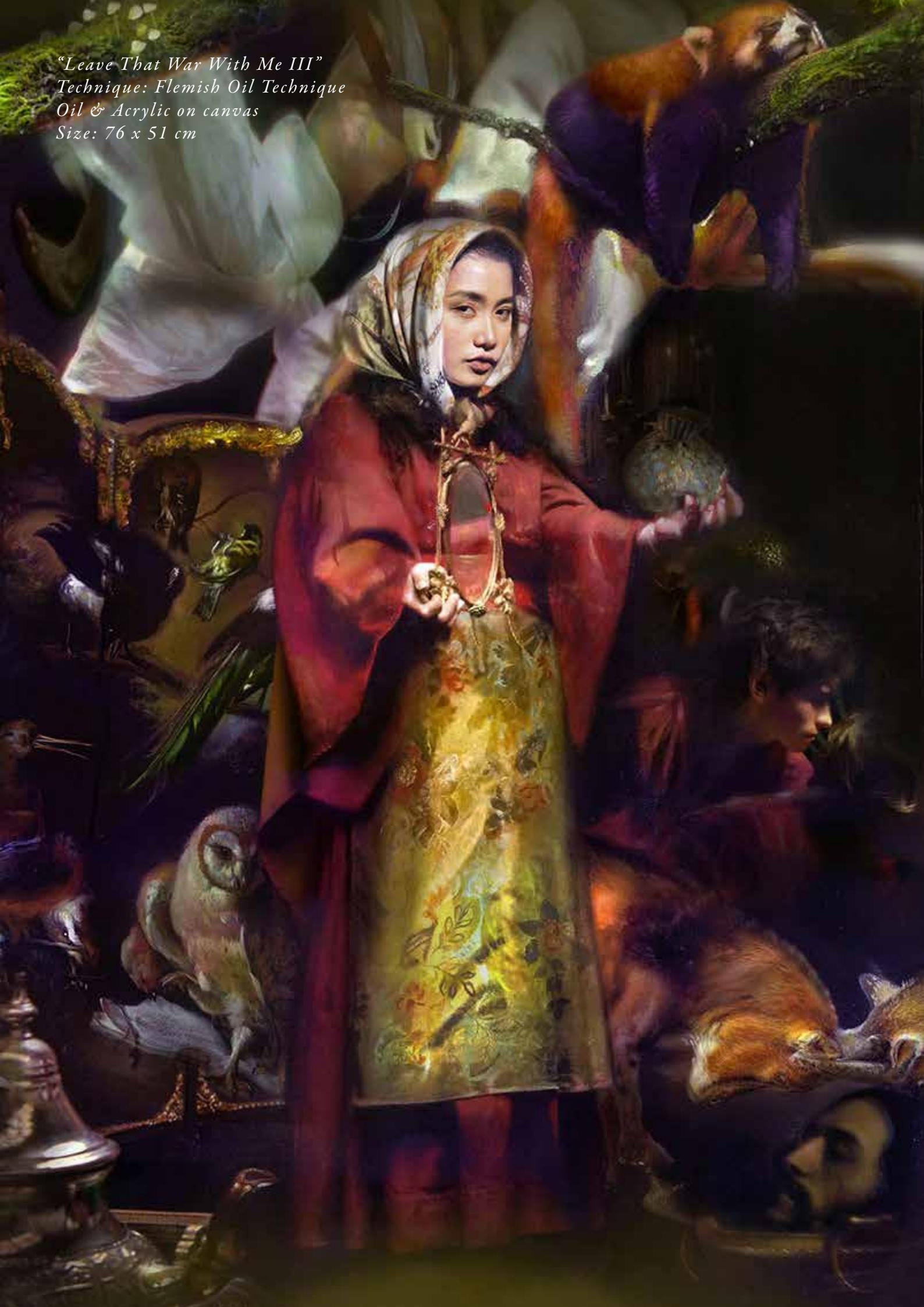
"Leave That War With Me III" Technique: Flemish Oil Technique Oil & Acrylic on canvas Size: 76 x 51 cm