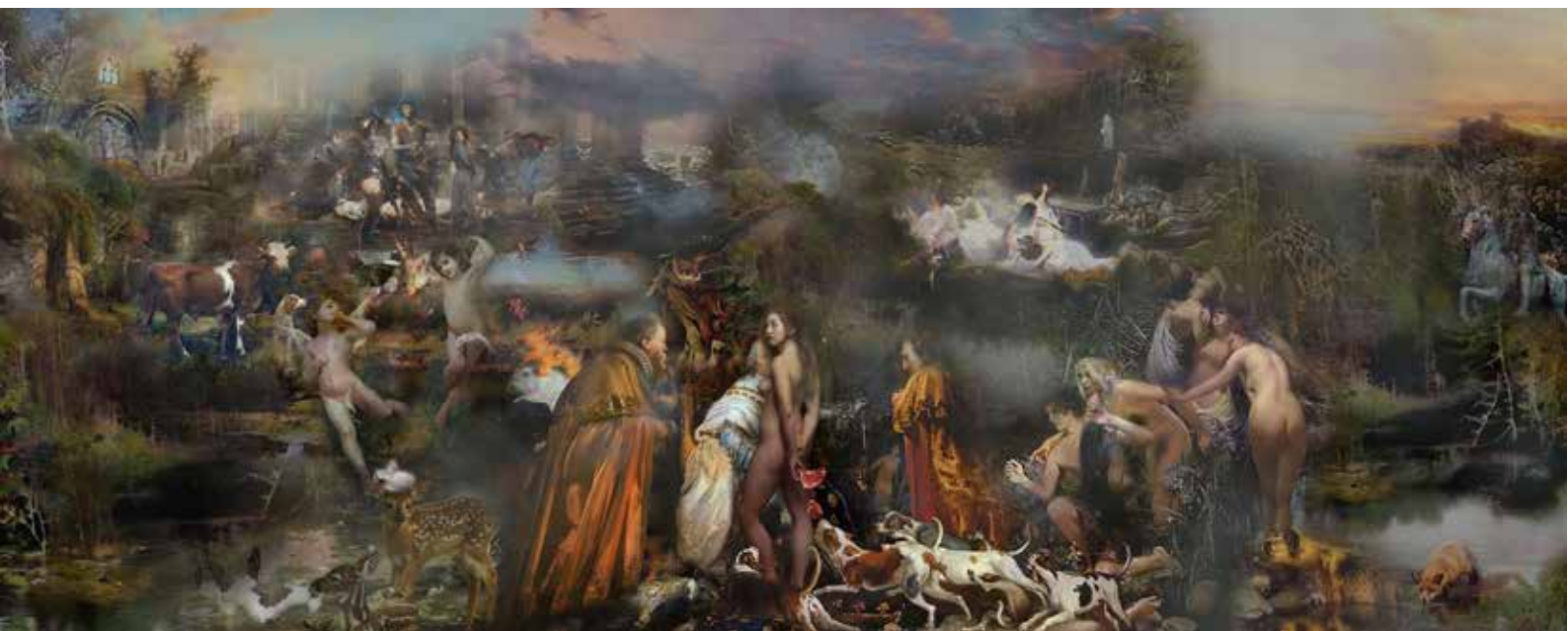
"Barefoot" Hand-finished Ltd Edition large format print acrylic, liquid bronze & gold leaf on Hahnemulhe paper

Size: 150x62cm [Only one left out of 11]