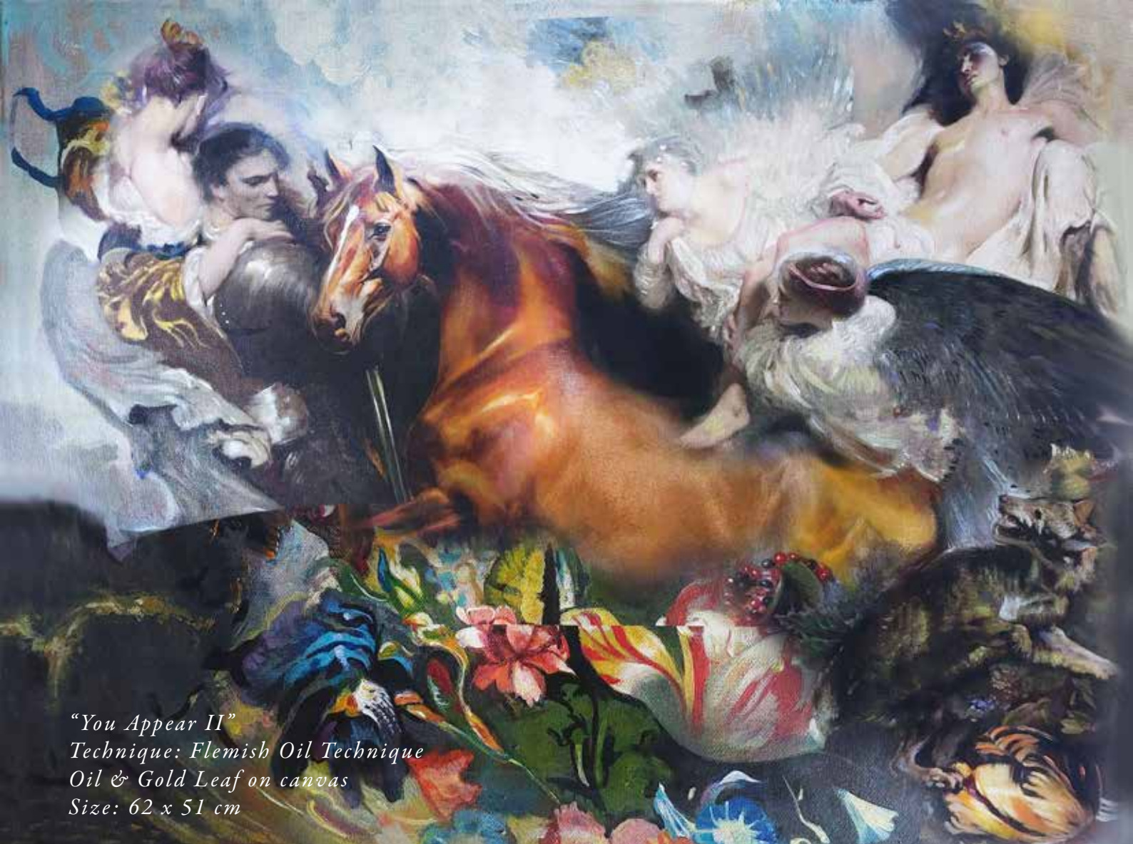
"You Appear II" Technique: Flemish Oil Technique Oil & Gold Leaf on canvas Size: 62 x 51 cm