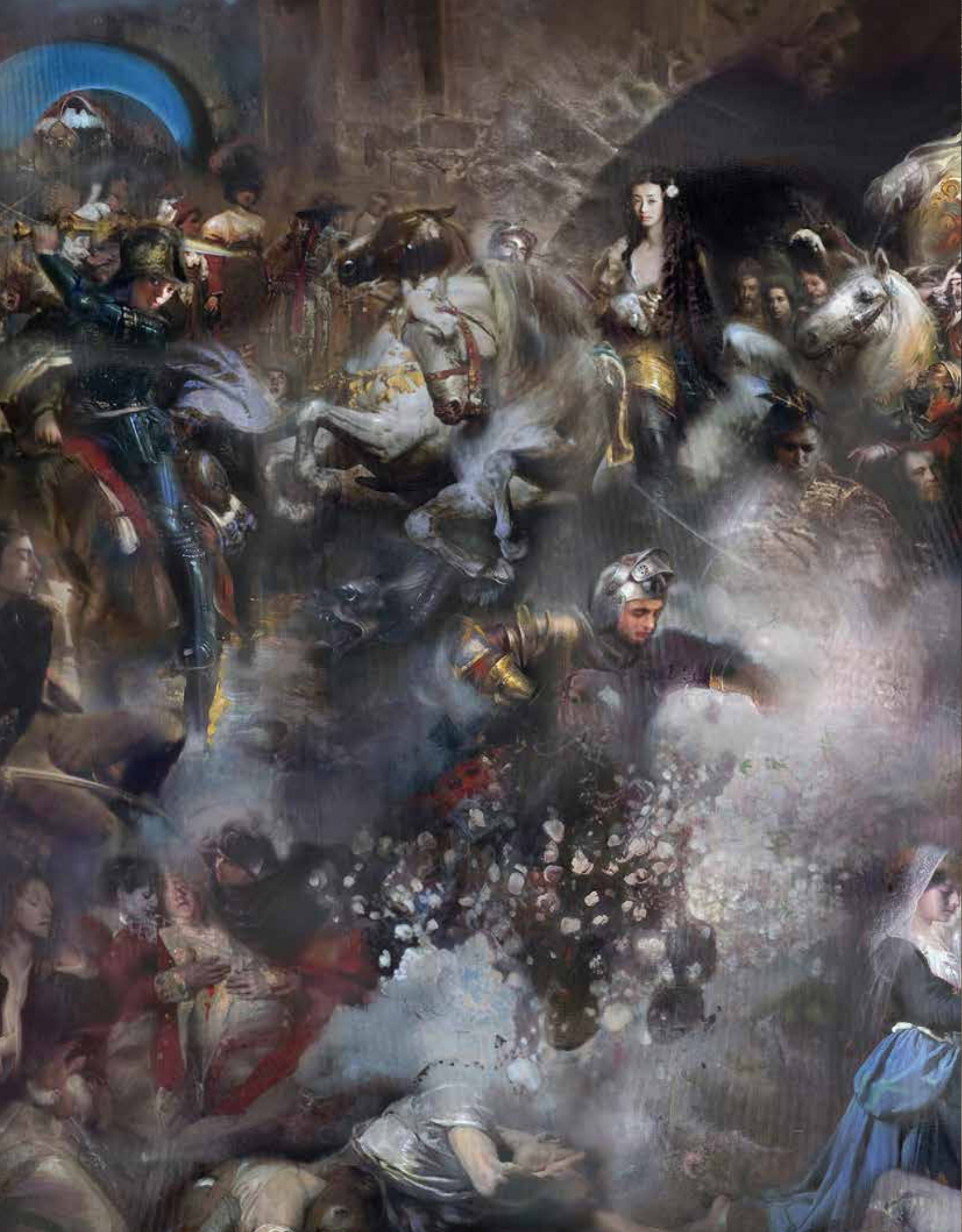
"The Red Painting" oil painting created 2023-24 / detail [on loan to MaxArt Gallery Nevada, USA] Oil on Canvas / Transparent Oil Technique on linen/cotton canvas